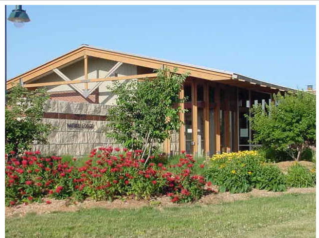
RACCOON RIVER NATURE LODGE