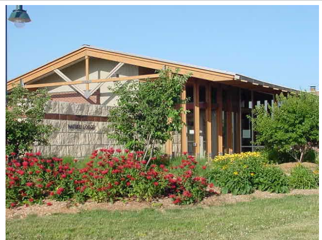
RACCOON RIVER NATURE LODGE