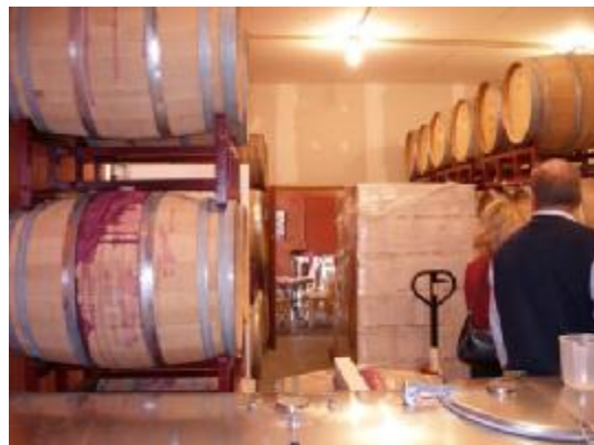
Tour through the Jasper winery warehouse.