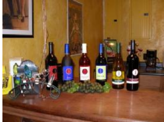
The six offered wines at the Jasper Winery.